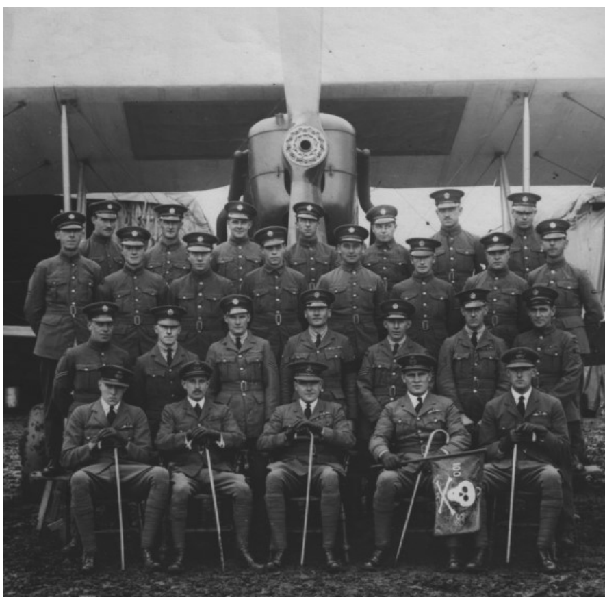
Hawker Horsley and Squadron personnel at Weston Zoyland 1927

Note the Squadron Standard, the walking sticks and puttees!