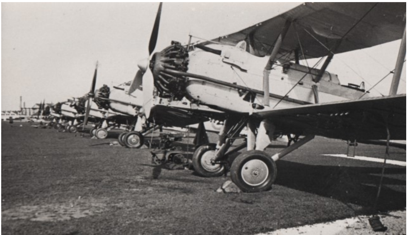
Vilderbeest MkIIs at Seletar, Singapore - January 1937