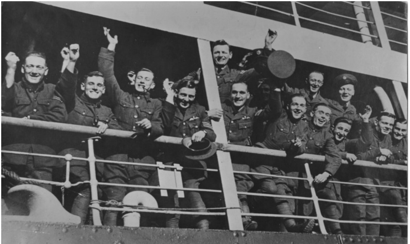
100 Squadron personnel on the P&O Liner "SS Rampura" at Tilbury docks prior to departure for Singapore in December 1933