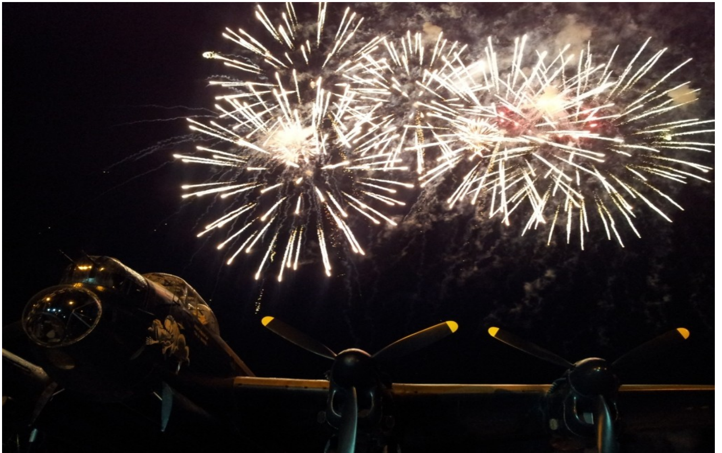
Is it fireworks or flak?