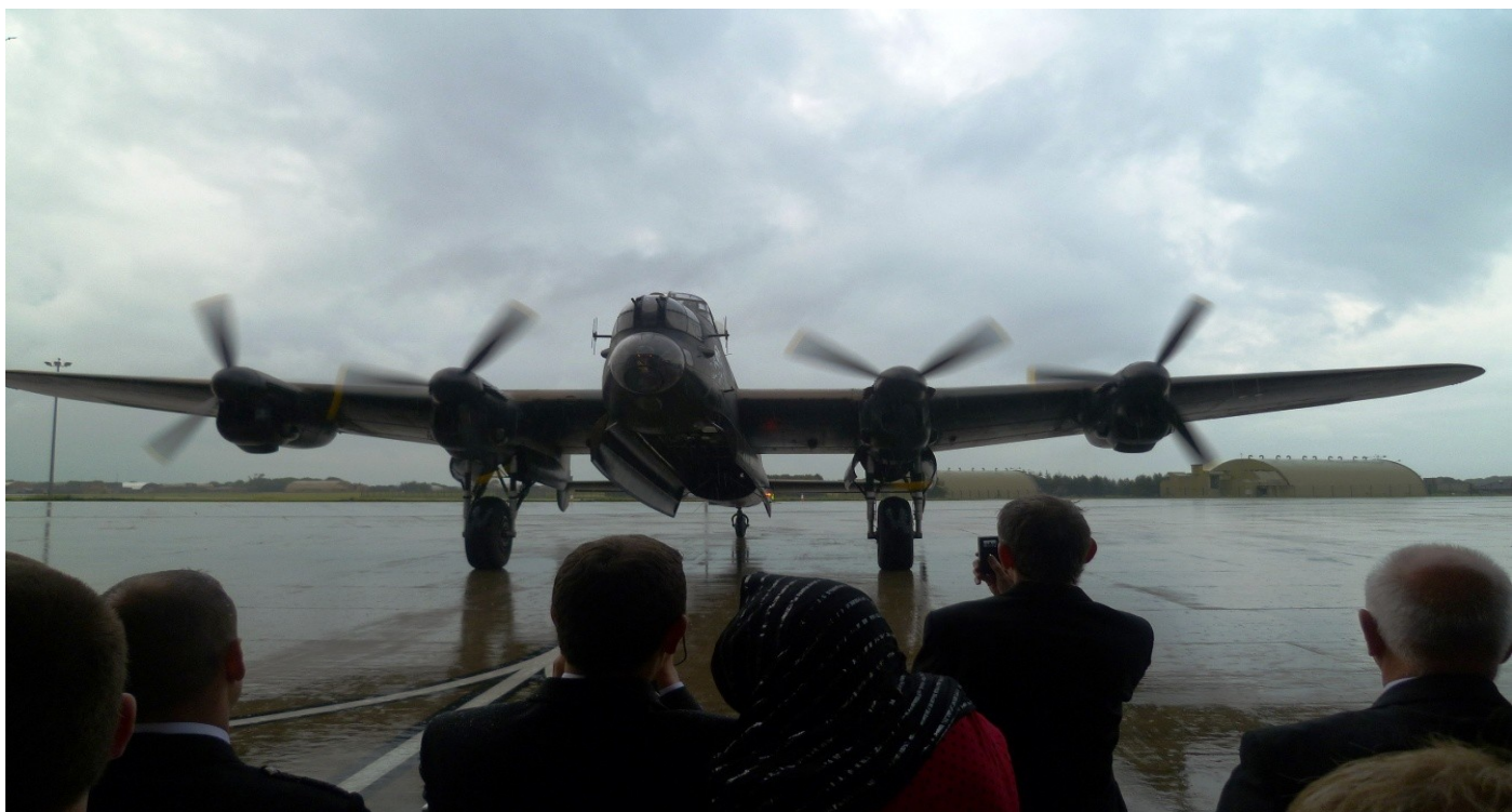
The Phantom arrives in the rain