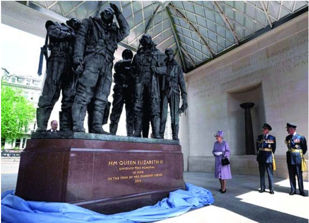
Her Majesty unveils the Memorial